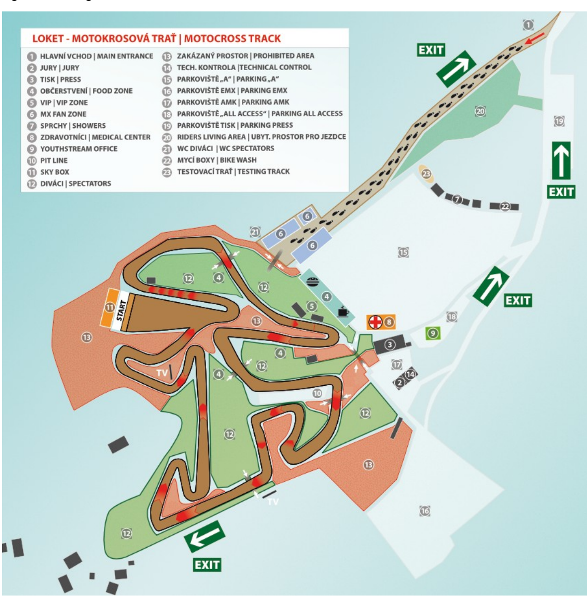
Page 3: Drawing of the circuit